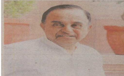
Subramanian Swamy taught at IIT-Delhi for three years.

The ministry has written to the DoPT earlier this month seeking to know whether Swamy's case falls under 54(A) of General Financial Rules and Service Rules. The ministry has also sought to